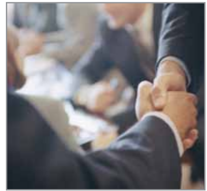
...And generate sales both online and at the event