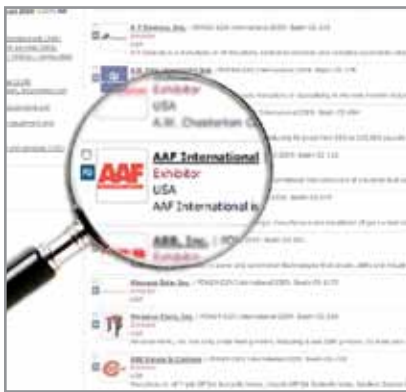
Your profile appears within the community